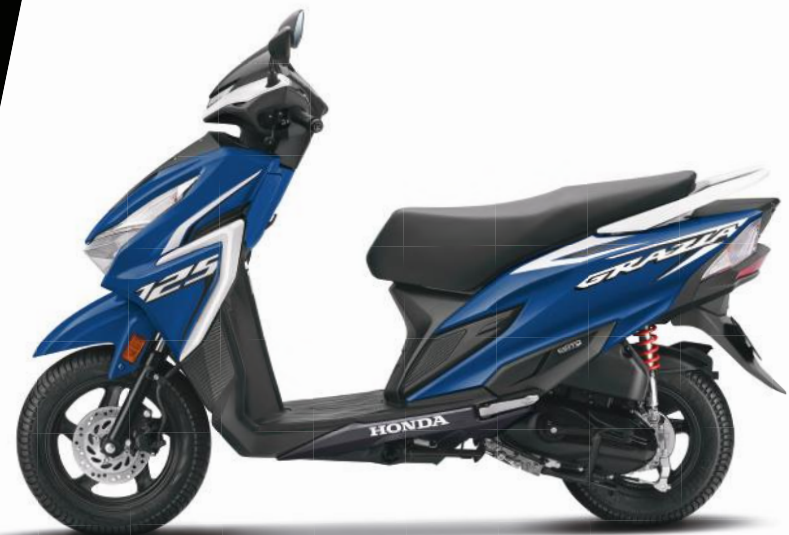
MAT MARVEL BLUE METALLIC