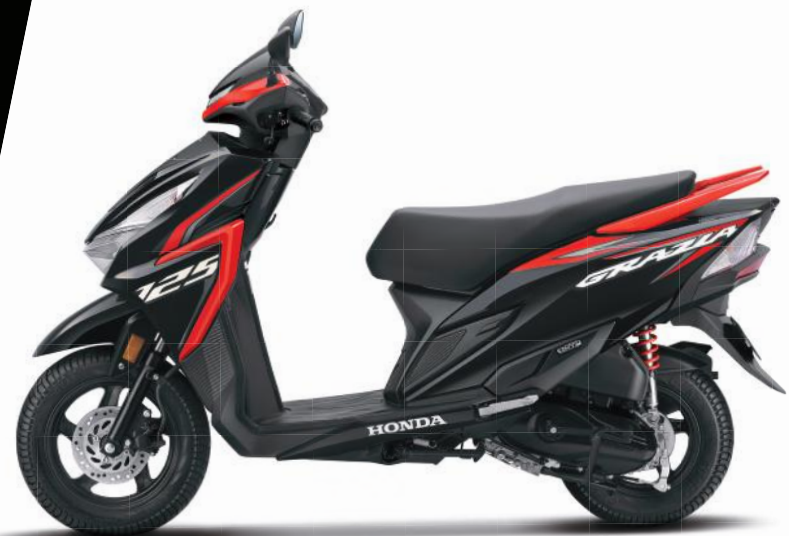
PEARL NIGHT STAR BLACK